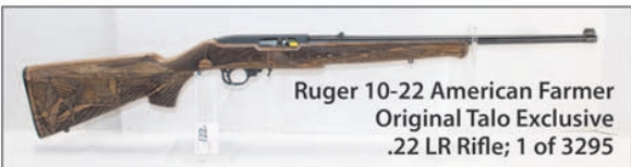
Ruger 10-22 American Farmer Original Talo Exclusive .22 LR Rifle; 1 of 3295