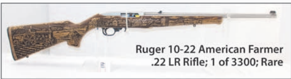
Ruger 10-22 American Farmer .22 LR Rifle; 1 of 3300; Rare