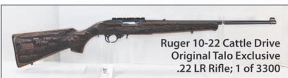
Ruger 10-22 Cattle Drive Original Talo Exclusive .22 LR Rifle; 1 of 3300