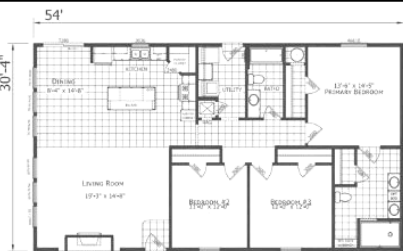
Wall of Windows