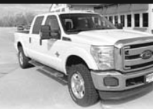
'15 FORD F-250 CREW CAB

Diesel, 4x4 Moody Price $26,995 STK C89879