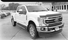
'21 FORD F-250 CREW CAB LARIAT

Diesel, 4x4, 46,000 Miles Moody Price $63,995 STK D90773