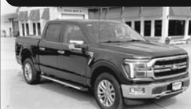
'24 FORD F-150 CREW CAB LARIAT