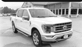
'22 FORD F-150 CREW CAB LARIAT

4x4, 23,000 Miles Moody Price $46,995 STK B30899