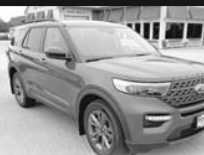
'22 FORD EXPLORER XLT

4x4, Leather, Bucket Seats Moody Price $33,995 STK B07733