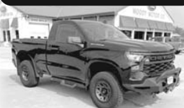
'24 CHEVY SILVERADO REG CAB

Short Box, 4x4 Moody Price $38,995 STK 127656