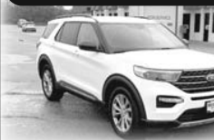
'23 FORD EXPLORER XLT

4x4, Leather Moody Price $37,995 STK A06199