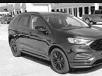
'22 FORD EDGE SE AWD

35,000 Miles Moody Price $26,995 STK A59515