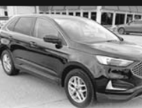
'24 FORD EDGE SEL AWD