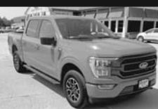
'23 FORD F-150 CREW CAB

4x4, XLT, 302A Pkg. Moody Price $44,995 STK D18751