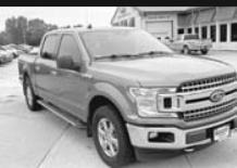
'20 FORD F-150 CREW CAB XLT