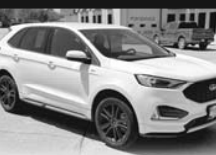
'24 FORD EDGE ST-LINE AWD

Short Box, 4x4 Moody Price $38,995 STK 127656