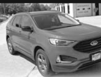
'23 FORD EDGE SEL AWD

4x4, Leather Moody Price $37,995 STK A06199