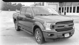
'20 FORD F-150 CREW CAB XLT

Diesel, 4x4, 46,000 Miles Moody Price $63,995 STK D90773