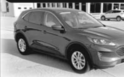
'22 FORD ESCAPE SE AWD

35,000 Miles Moody Price $26,995 STK A59515