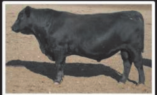
Lot 23 ~ Sitz Intuition