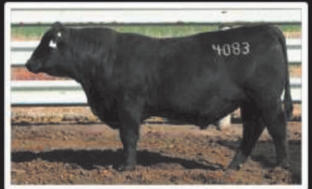
Lot 32 ~ VDAR Gallatin 7568

This sale will be broadcast via CattleUSA.com Watch/bid online through Platte Livestock Site.