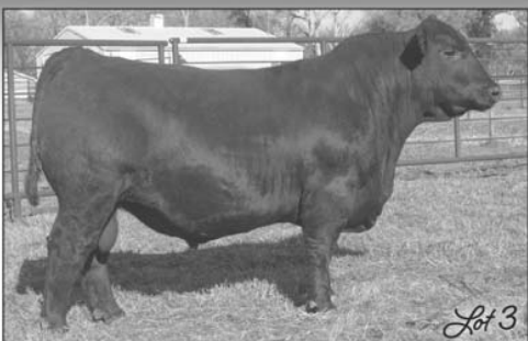
LOUP VALLEY WOODROW 4180 21121506 BW: +0.6 WW: +64 YW: +107 Milk: +37