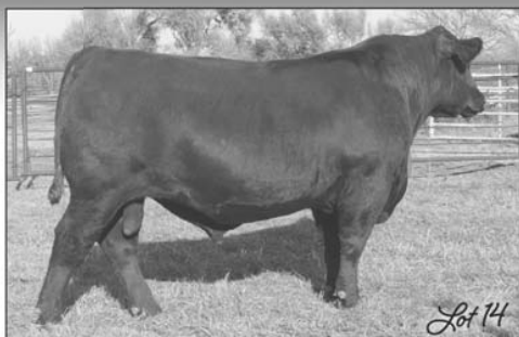
LOUP VALLEY DUKE 490 21126904 BW: +0.4 WW: +89 YW: +156 Milk: +39