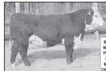
DM 183F MASTERPLAN 931A

Horned • Reg#44681791 • Sire: CL 1 DOMINO 0186H