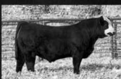
LOT 9 - PB SIMMENTAL - BW 84