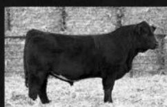
LOT 6 - PB SIMMENTAL - BW 86

COME EARLY SALE DAY TO VIEW THE BULLS AT THE FARM, THEN JOIN US FOR LUNCH & BULL AUCTION AT OUR NEW LOCATION, UTICA HALL!