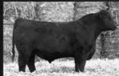
LOT 43 - PB ANGUS - BW 85