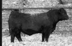
LOT 26 - 3/4 SIM 1/4 ANGUS - BW 78