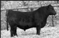
LOT 50 - PB ANGUS - BW 78