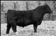
LOT 39 - PB ANGUS - BW 88