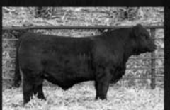
LOT 2 - 5/8 SIM 3/8 ANGUS - BW 82