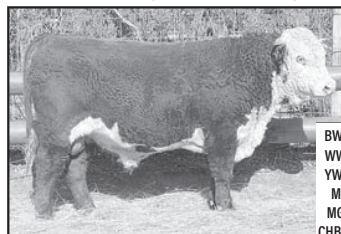
HM 0186H DOMINO 926A

Horned • Reg#44681791 • Sire: CL 1 DOMINO 0186H