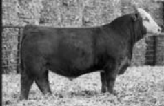
LOT 22 - 3/4 SIM 1/4 ANGUS - BW 79