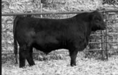
LOT 10 - 3/4 SIM 1/4 ANGUS - BW 86