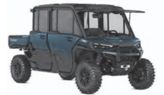
2026 Can-Am Defender MAX Limited HD11