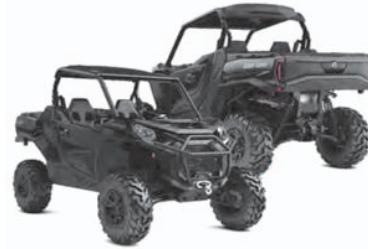
2026 Can-Am Commander XT 1000R