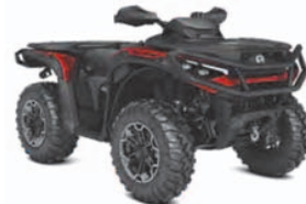
2025 Can-Am Outlander XT 1000R