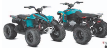
2026 Can-Am Renegade 70 EFI 2026 Can-Am Renegade 110 EFI