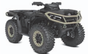
2026 Can-Am Outlander Backcountry 1000R