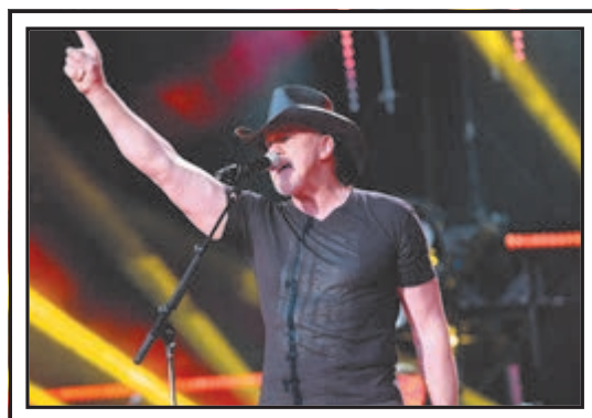
Trace Adkins 9:30 pm

Thursday, July 23 Ultimate Bull Riding 7:30 pm Friday, July 24 The Outlaws Truck & Tractor Pull 6:30 pm Sunday, July 26 Demo Derby 6:00 pm